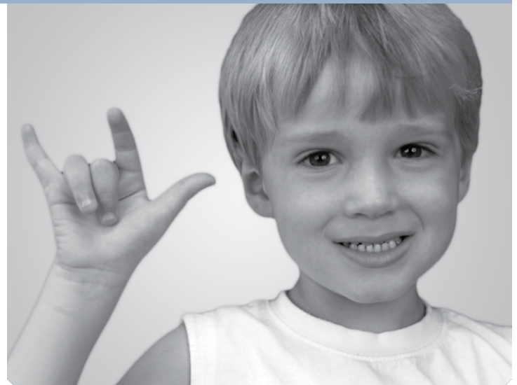
A young boy signs "I love you."

The exact beginnings of ASL are not clear, but some suggest that it arose more than 200 years ago from the intermixing of local sign languages and French Sign Language (LSF, or Lingue des Signes Française ). Today's ASL includes some elements of LSF plus the original local sign languages, which over the years have melded and changed into a rich, complex, and mature language. Modern ASL and modern LSF are distinct languages and, while they still contain some similar signs, can no longer be understood by each other's users.